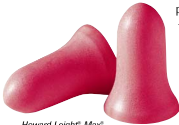
Howard Leight® Max®

When earplugs and an earmuff are used together simultaneously, we call this “dual protection” or “double protection.” Dual protection is often the only available method to achieve maximum protection from hazardous noise. Using earplugs and earmuffs concurrently seriously isolates the wearer, so it is warranted only in extreme noise levels.