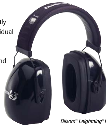
Bilson® Lightning® L3

At what noise level is dual protection advisable? There is no clear answer, mostly due to the varying amounts of protection each wearer receives from the individual fit of his/her hearing protection. But some research suggests dual protection is overused. One study using continuously monitoring dosimetry (noise measurements taken under the earplug or earmuff) among coal miners found that with properly fitted hearing protectors, there was no need for dual protection even in ambient noise levels of 107 dBA TWA. 4 When a high attenuation earplug or earmuff is properly fitted and the user is motivated to use it correctly, some hearing professionals say the need for dual protection is rare. The effort expended by a safety manager to enforce dual protection is often better-spent in ensuring best fit of single hearing protection.